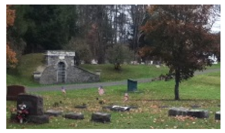
Above: The cemetery

The local cultural concern that the village have the same amenities as any other urbanized setting was apparent in a number of early projects that contribute to the character of the village today. The residential character was established along urban schema from an early stage in the village's history, and houses are of course still relatively close to each other and set to a common setback along the streetscape. During the 1890s, the cemetery was constructed in its present form in a manner inspired by the "City Beautiful" movement (Thomas 2013). Villagers formed the Hartwick Cemetery Association to purchase the fairgrounds next to the original cemetery, laid out a road system, and completed it with a new vault and terraced gardens. Now paved, the cemetery is still used as a park as it is good for bicycling, walking, and other such sports.