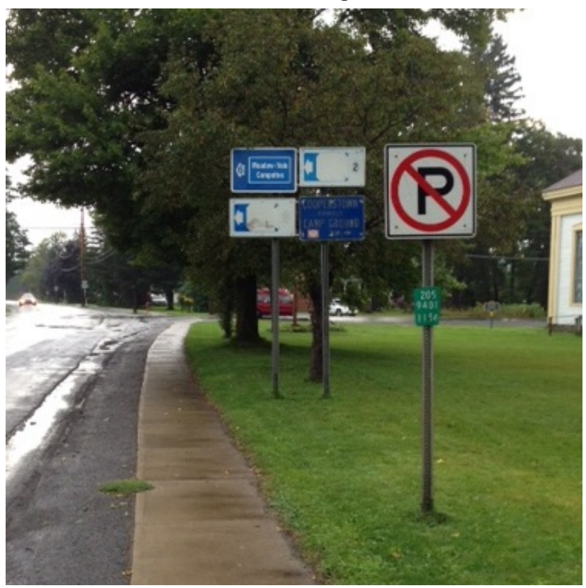
The "blue signs" and massive parking sign. The state claims that removing the blue signs and adding a directional sign to Cooperstown eight miles away would create "sign clutter" and be unsightly.

additional destination signs are not warranted per the Manual on Uniform Traffic Control Devices. "Sign clutter" is a very real problem that can cause driver confusion and detract from the overall aesthetics of the Hamlet. The Department will not be adding any additional signing at this time.