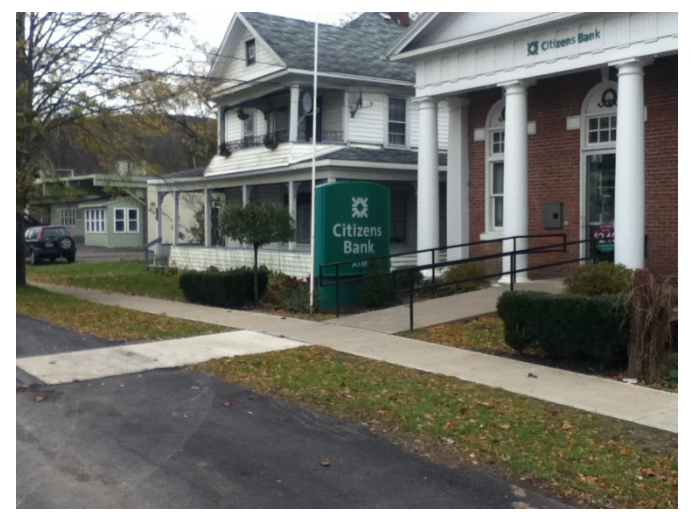
Above: Main Street