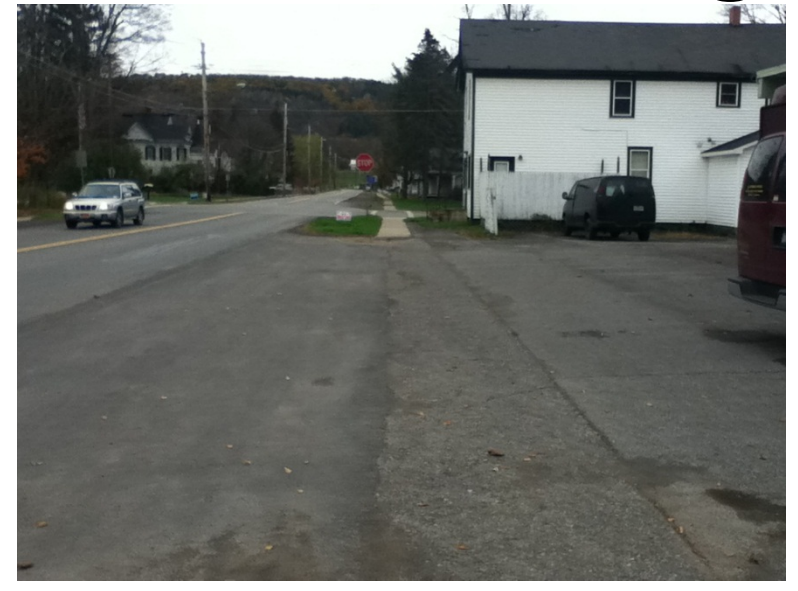
Main Street, today and in the past