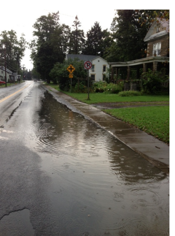
NY 205 after a moderate rain

It was not just the county-owned Main Street that faced aesthetic issues. The state highway, formerly known as North and South Streets, has had no significant repairs except for occasional resurfacing in decades. The townowned sidewalks are uneven, with one side of the street having received brand new sidewalks during a water system project in 2009 but the other side of the street making due with the asphalt sidewalks last paved during the 1980s. A blue directional sign erected by the state for which local businesses can buy advertisements sits half empty at the intersection with Main Street, yet a more functional sign directing drivers to nearby communities is not found in the village. The streets have no curbs and poor drainage, the new sidewalks flanked with a strip of asphalt between the street and concrete walks. The local government has asked for some assistance from the state, including a lower speed limit and a sign to direct local tourists to Cooperstown, but to little effect.