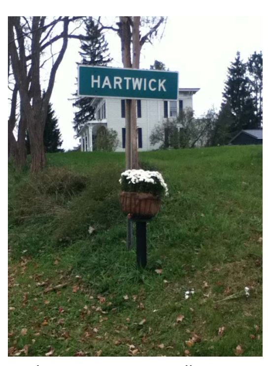
Above: Entrance to village on North Street

Civic character is distinct in that it stresses public investment, through either governmental or other organizational means, in the physical structure. It contrasts with other forms of character, such as economic or residential character, by this group level involvement. Economic character should be understood as the status of business traditions at one point in time, and is reflected in many metropolitan areas, for example, by a shift from downtown retail development to that found in shopping centers and malls. Residential character refers to the status of housing in a community. Indeed, both reflect decisions made at the individual level and any community impacts are the result of emergent characteristics; civic character is most often a planned community impact. Civic character is the result of historical processes manifest in one time and place, and thus becomes the impetus for action in the future.